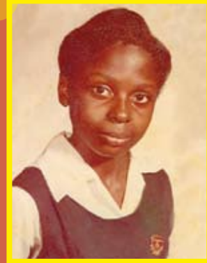
Check our next issue for the answer