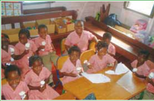
Children from Orange Hill Basic enjoy their ice cream.