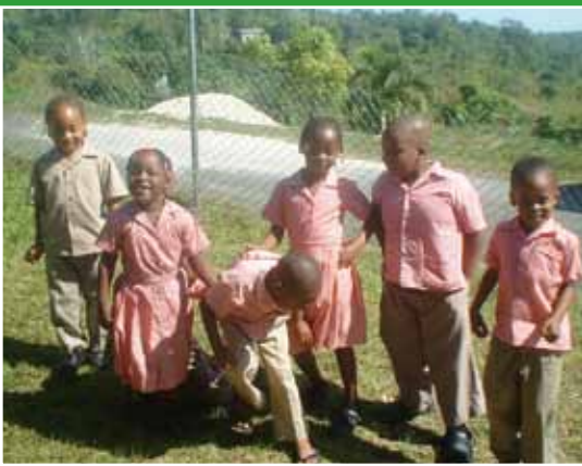
Orange Hill Basic schoolers having fun in the sun