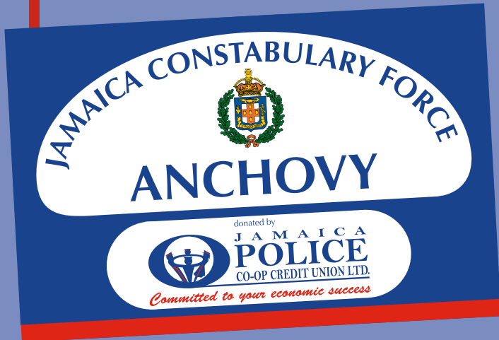
New Station sign at Anchovy